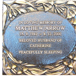
C185185 Flower Gum